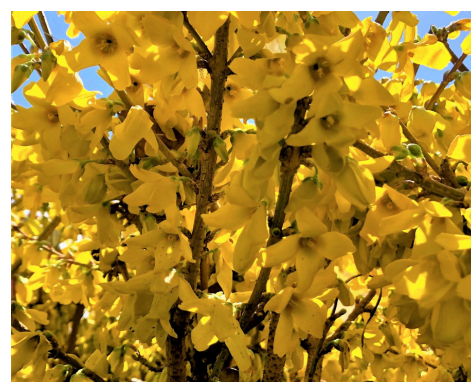
Forsythia 'Northern Gold'